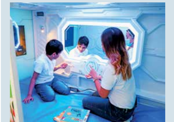
● A Sensory Pod at The Doris Duan-Young Autism Center

All of these state-of-the-art facilities can be showcased to communicate innovation and DDY'S commitment to comprehensive care which has been further demonstrated through the Excellence Awards received from Dubai Healthcare City Authority for two consecutive years, 2019 and 2020.